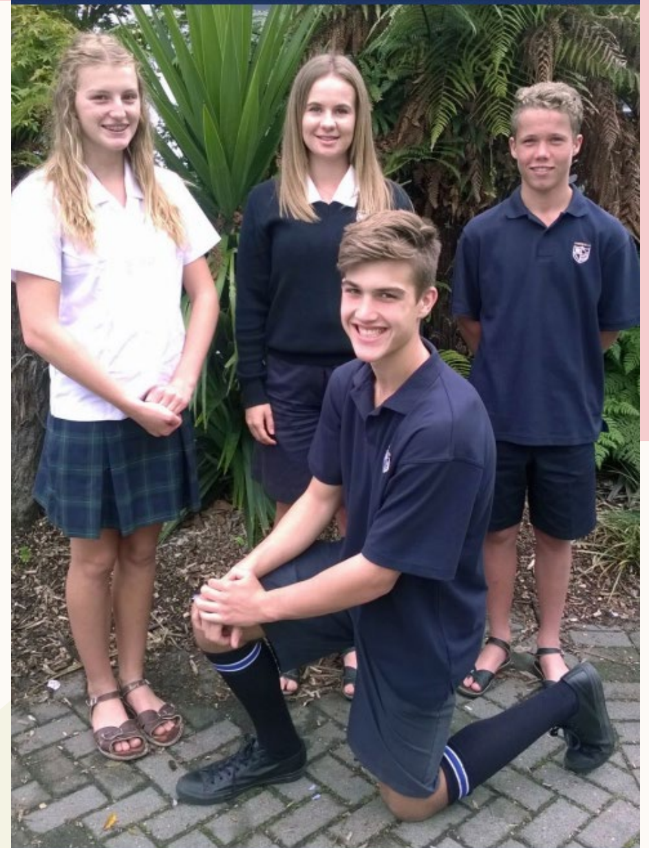
Year 9-12 Summer Uniform