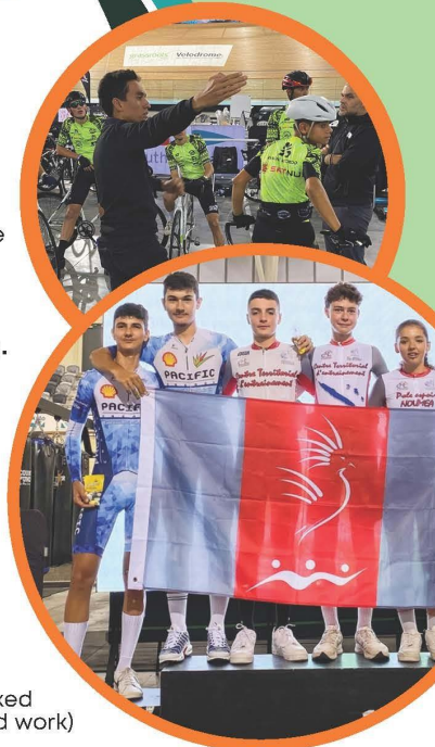
Pictured: Young riders from around the world including Tahiti and New Caledonia